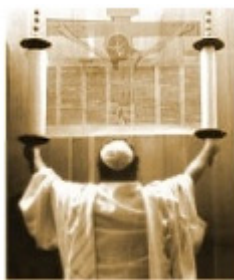
Revealed in Torah

"Behold, the days come, saith the LORD, that I will make a new covenant ( B'rit Chadashah ) with the house of Israel, and with the house of Judah: Not according to the covenant that I made with their fathers in the day that I took them by the hand to bring them out of the land of Egypt; which my covenant they brake, although I was an husband unto them, saith the LORD: But this shall be the covenant that I will make with the house of Israel; After those days, saith the LORD, I will put my law ( Torah ) in their inward parts, and write it (the Torah ) in their hearts; and will be their God, and they shall be my people. And no longer shall each one teach his neighbor and each his brother, saying, 'Know the LORD,' for they shall all know me, from the least of them to the greatest, declares the LORD. For I will forgive their iniquity, and I will remember their sin no more." (Jeremiah 31:31-34)